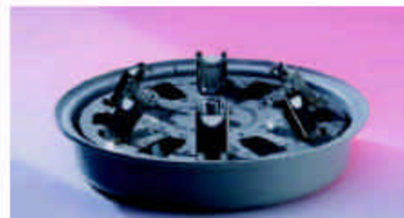
JC101 The optionally obtainable, sealed rotor handles up to 24 samples per run. It protects the operating staff when loading, using and unloading into the safety chamber. The rotor is autoclavable.