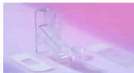
JC313 ECO funnel reusable chamber, 12 units JC315 ECO seal for ECO funnel, 100 units JC322 ECO funnel disposable chamber, 100/500, units JC314 ECO micro slide carrier, coated, 100 units