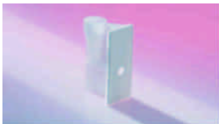
JC320 Cellfunnel disposable sample chamber, 100/500 units JC304 Cellfunnel reusable chamber, 12 units