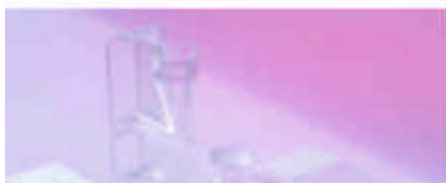
JC305 Filter cards for Cellfunnel SC304, 200 units JC310 CytoSlide - single cycle, uncoated, 100 units JC311 Cyto Slide - single cycle, coated, 100 units