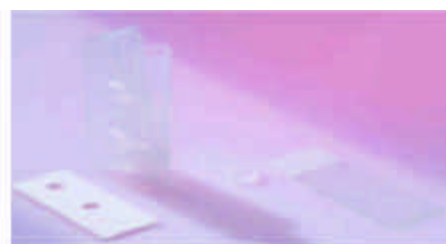
JC306 Double Cellfunnel reusable chamber, 12 units JC307 Filter cards for double Cellfunnel JC306, 500 units JC321 Double Cellfunnel disposable chambers, 100/500 units JC309 Cyto Slide - double cycle, uncoated, 100 units JC312 Cyto Slide - double cycle, coated, 100 units