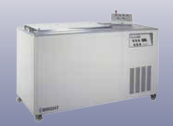
8250 & 9400 Electro-Linear Sledge Microtome Full Body Cryostats