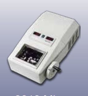
2212 Micro Cryostat Portable BenchTop Micro-Crypstat